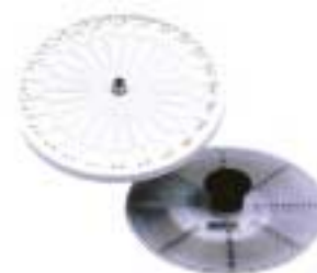
BOE 02050 Haematocrit rotor

The haematocrit value can be read off the lid/evaluation disc right after centrifugation.