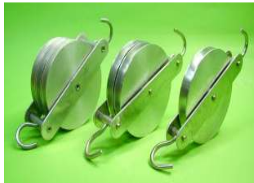
PA-83-2, PA-83, PA-82