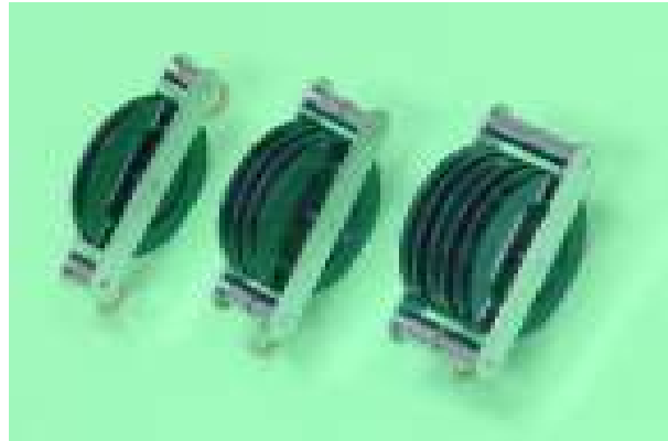
PA-80A, PA-81, PA-80